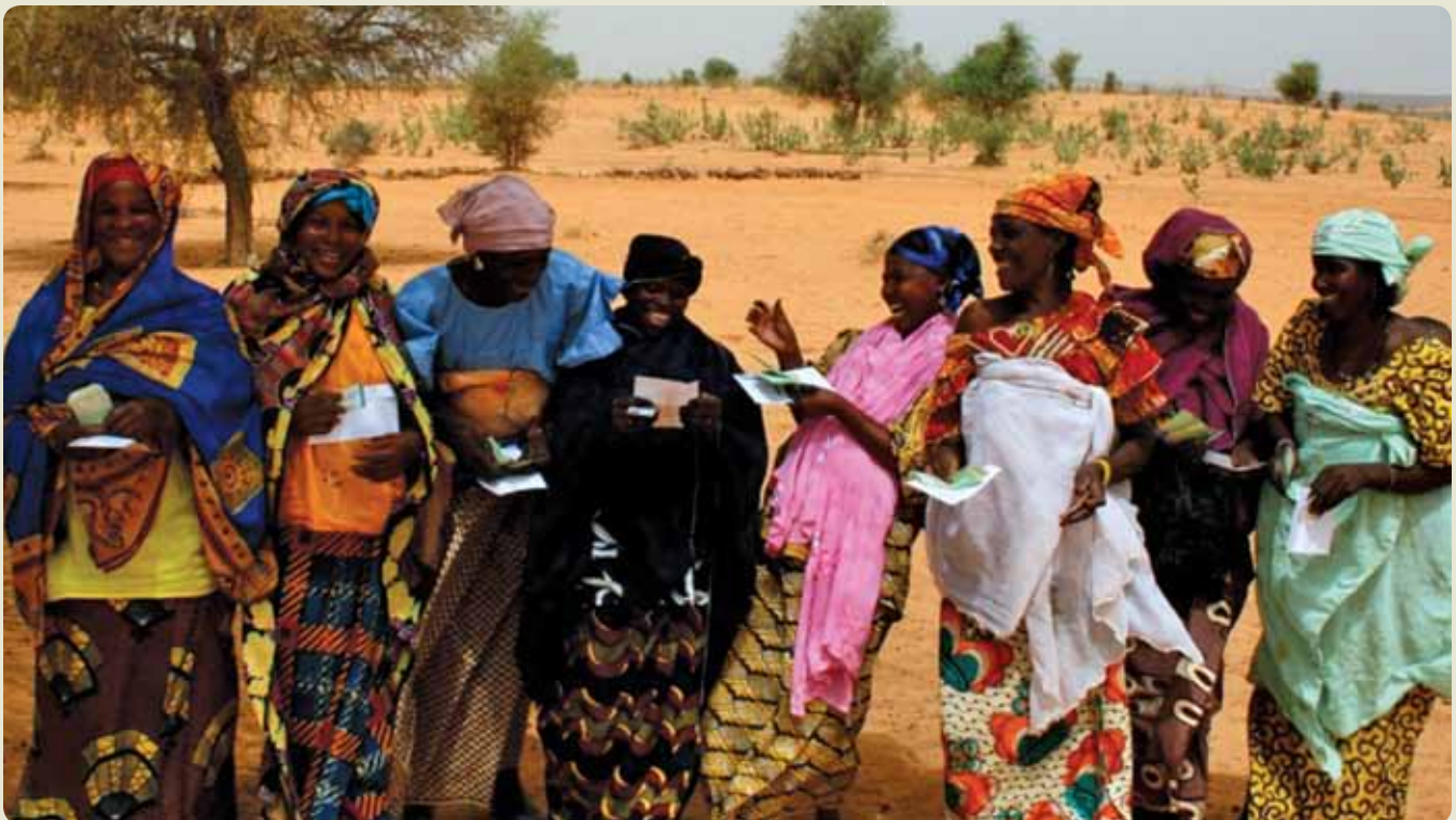
Beneficiaries of Concern's mobile cash transfer program that was rolled out in Tahoua, Niger in 2010.