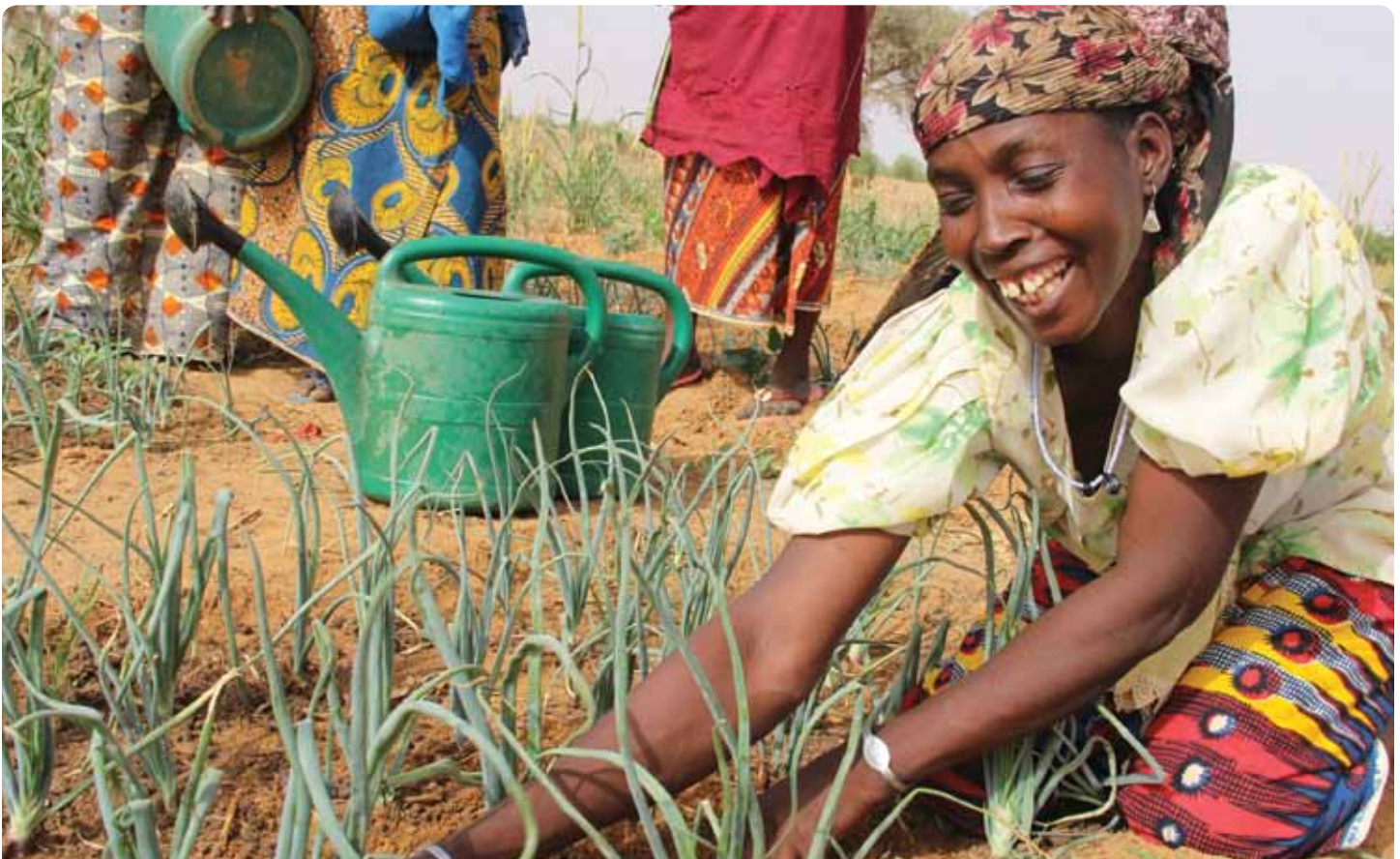
Women of the Concern-supported Kolkoli villages gardening interest group. The vegetables are eaten and sold to buy cereals. PHOTO: TAGAZA DJIBO, NIGER.

People should also be supported to undertake alternative livelihood activities in rural areas. This can be done through technical and vocational training, establishment of micro-finance programs, and tax breaks and incentives such as subsidies. Safety nets and social protection programs should be provided to vulnerable people who are unable to work or produce sufficient food.