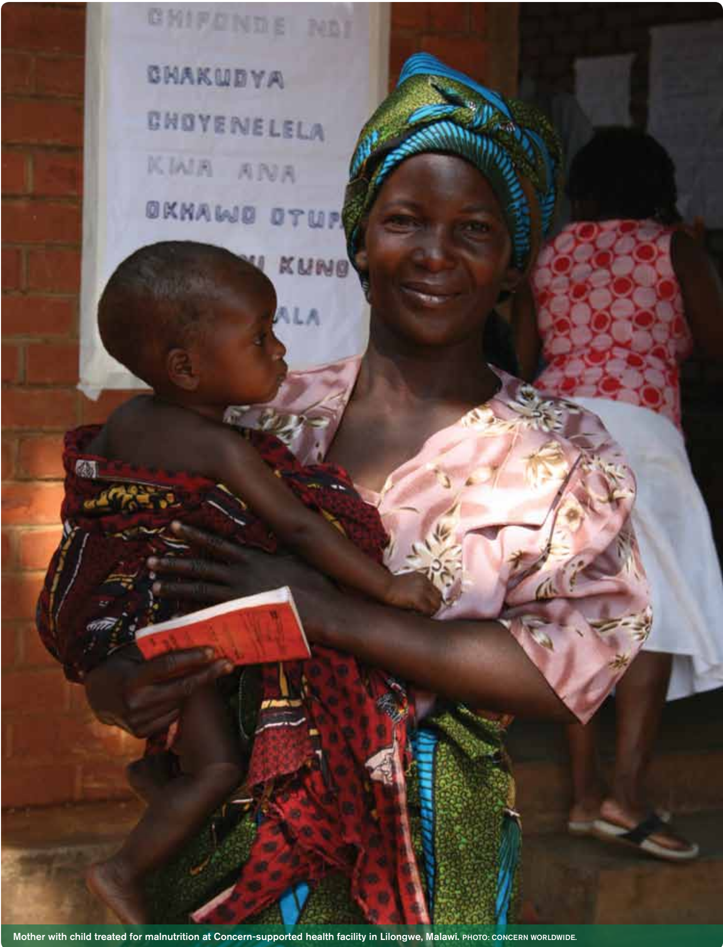
Mother with child treated for malnutrition at Concern-supported health facility in Lilongwe, Malawi.