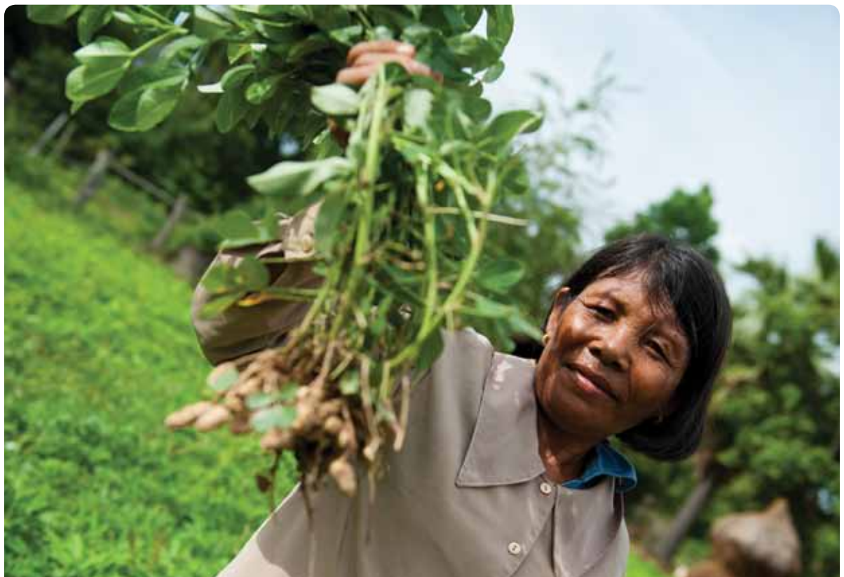
Local farmer shows off a freshly pulled peanut plant on her farm. She has taken advantage of the integrated farming techniques and now grows limes, peanuts, bananas, green beans, chilis, and more.

Investment in smallholder farmers can lead to both improved household food and nutrition security and wider economic impact. A Concern Worldwide case study in Rwanda demonstrates that with a targeted package of support to increase agricultural productivity and link to savings programs, farmers with small plots of land were able to triple their crop productivity and improve crop diversity. Households also increased food consumption and dietary diversity, started to employ other people, and built resilience to external shocks such as erratic rainfall or illness in the household. 21